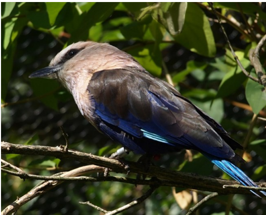
Elliott Kreeger Blue Bellied Roller