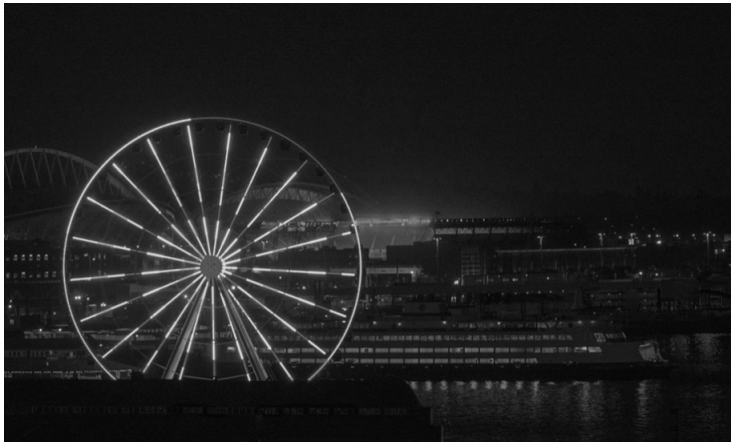
Elliott Kreeger Great Wheel & Neighbors 37(s)