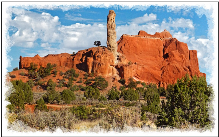
Sylvia Ewins Sandstone Chimney