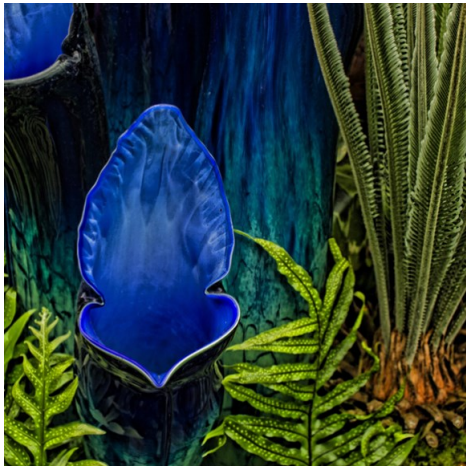
Monya Waskowich Blue Glass