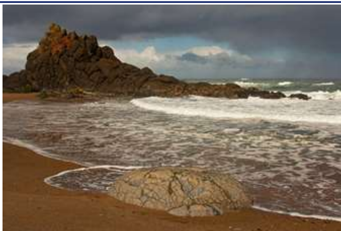
Alan Moodie - Beach Rock