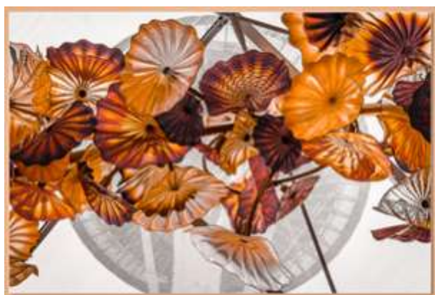
Sheri Diggins - Looking Through the Glass