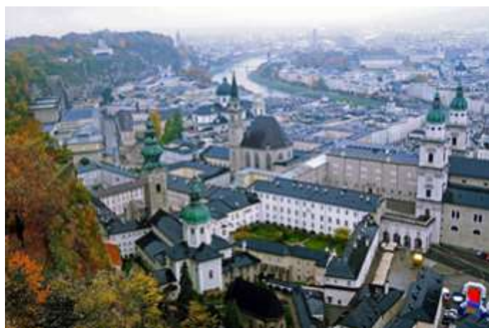
Fred Fu - Munich