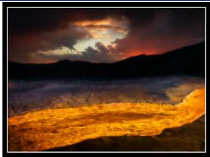
Mike Livdahl - Fire River