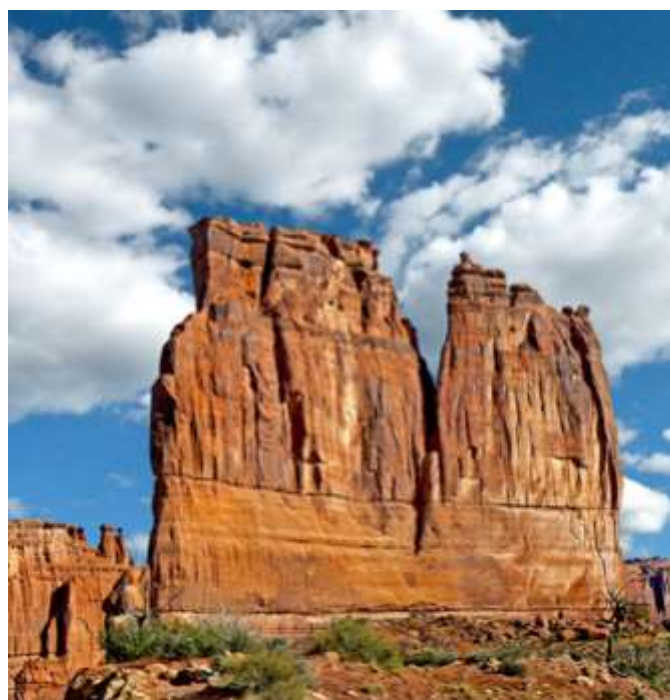
Sylvia Ewins - The Organ