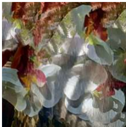
Maurene Rutkin - Orchids in the Tropical Jungle