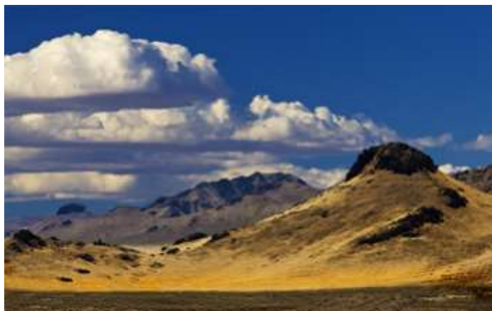
Norman Share - Oregon Route 376 View