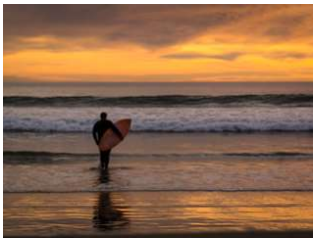
Fran McCullough - Sunset Surf