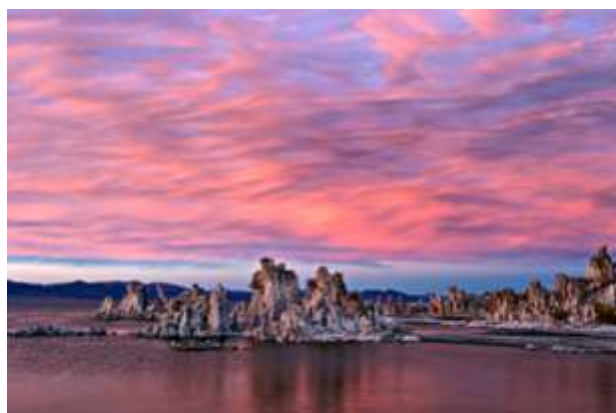
Kathy Admire - Sunset at Mono Lake