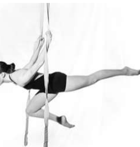
Justin Engelman - Flying