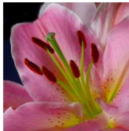
George Ferarra - Inner View