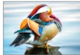
Mandy Image Id=17007941

Remove from Competition, Keep in Image Library