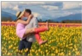
A Kiss in the Tulip Fields Image Id=17505488

You have reached the maximum entries allowed per person of 2 for this Competition. To submit a different image, you must first delete one of the already submitted images.